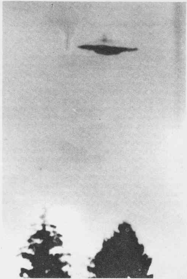
This was the first shot of Semjase's extraterrestrial vehicle, taken by Eduard Meier, just after sighting the UFO.

began to hear the humming sound again. Suddenly the strange craft shot in from the East and circled over the woods as it slowed down. As the humming diminished this time I understood the strange behavior of the animals. Evidently they had somehow become aware of the presence before it appeared overhead. The object curved over the trees towards the clearing and settled gently on the grass. I hurriedly snapped another picture as it was coming down. It was 2:31. It made its landing softly and without a stir near the trees. As soon as it landed, I, full of curiosity, ran toward it to get closer and possibly photograph it then. But, about 100 meters from the object, I was