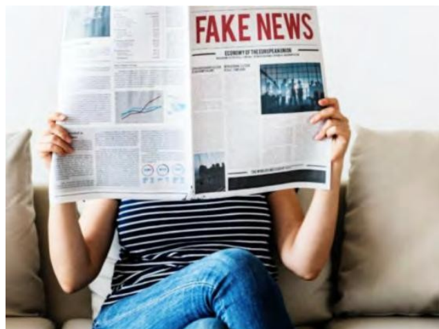
EU-No-Newsletter, News | 30 January 2020

Home /EU-No-Newsletter, News/Obvious scaremongering by trade associations