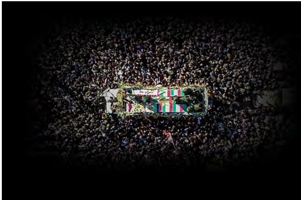
Funeral service of Qasem Soleimani in Ahvaz, Iran on 5 January 2020.

"The German government must stop slowing down the efforts of other states to effectively curb Iranian expansionism," demanded the Mideast Freedom Forum Berlin (MFFB) as early as 2008. The NGO initiates conferences and acts as "advisor" to the press, government and parliaments. 1 The MFFB, which cooperates with think tanks such as the American Enterprise Institute financed by ExxonMobil and other large corporations, never tires of emphasizing the "impossibility of dialogue" with Iran - although the country is entangled in conflicts in Syria, Yemen and Lebanon, it has never waged a war of aggression. And even though the MFFB board sends out unmistakable messages such as "The Iranian bomb must be prevented by all means", its PR events, known as "educational seminars", are supported by the German government.