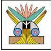
Spiritual Teaching Peace Symbol