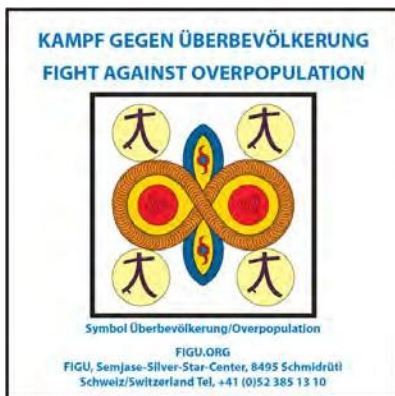
Original symbol overpopulation

http://alles-schallundrauch.blogspot.com/2020/02/glueckwunsche-die-briten-fur-den-brexite.html#ixzz6CxxSUKYN