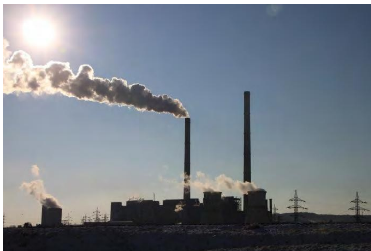
Symbol image: Air pollution

The concentration of the climate gas carbon dioxide in the atmosphere has exceeded the barely tolerable threshold of 350 ppm (parts per million), the ratio of \text{CO}_2 molecules to the remaining particles, for many years. The measuring station on the 3800-meter Mauna-Loa in Hawaii reported a peak value of 405.51 ppm in early October 2018. The natural value fluctuated on average between 180 ppm in cold periods and 300 ppm in warm periods. Before the great industrialization of 1870, it was 288 ppm. If all fossil fuel reserves were burned, the \text{CO}_2 content could probably reach 5000 ppm in 280 years, five times as high as in the days of the dinosaurs - and it was an average of 8 degrees warmer than today.