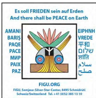
The symbol of peace

(wrong peace symbol ☹ = Celtic death rune (turned down "life rune") ☹)