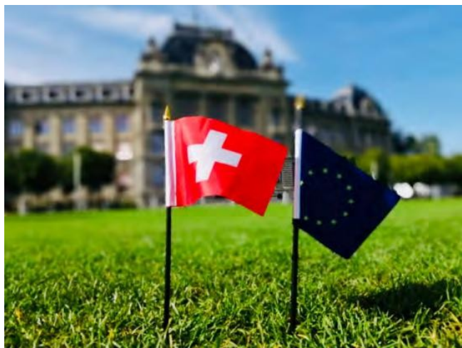
EU-No-Newsletter, News | 16 January 2020

Home /EU-No-Newsletter, News/Swiss research institutions can be instrumentalised